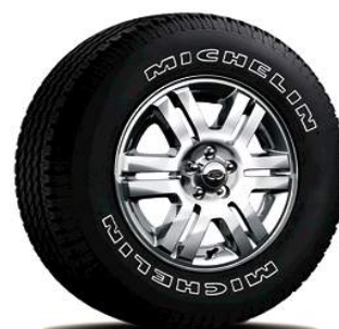
18" Chrome Clad Aluminum Wheel – 649 (Included w/Limited Chrome Package (67A))