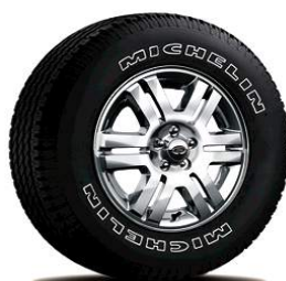
18" Chrome-Clad Aluminum Wheel (Opt. Eddie Bauer and Std. Limited) (649)