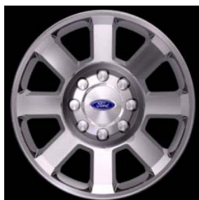
20" Premium Polished Forged Aluminum (XLT, FX4, Lariat) (Optional) (642)