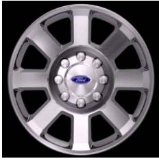
20" Polished Forged Aluminum (Optional) (XLT, Sport, FX4, Lariat SRW) (642)