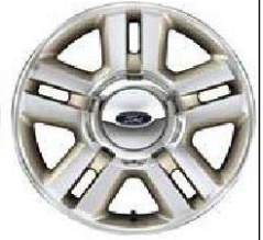
18" Bright Aluminum Wheel (Std. Lariat) – 64M