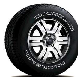
Ironman Wheel 18" Machined Aluminum Wheel (Included with Ironman Package) (64T)