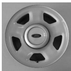
17" Steel Wheel (Std. – SSV (Non-EL)) – 64D