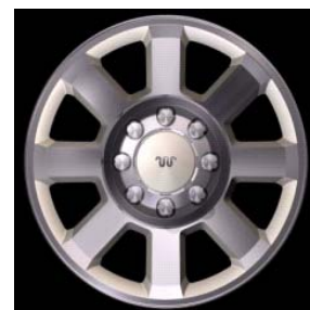
20" Painted Polished Forged Aluminum★ (Optional on King Ranch) (643)