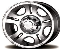
15" Machined "Split Spoke" Cast Aluminum (SPORT 4x2 R/C & S/C) (64H)