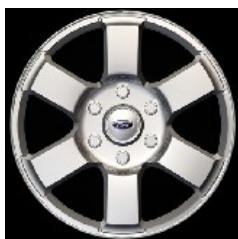
17" Aluminum Wheel (Std. XLT (Non-EL/EL & SSV EL)) – 64I