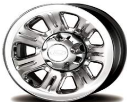
15" 7-Spoke Chrome Clad Steel (XLT 4x4 R/C & S/C, SPORT 4x4 R/C option on XLT & SPORT 4x2 R/C) (64G)