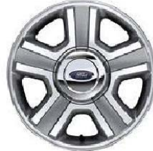
17" Machined Aluminum Wheel w/Painted Accents (Opt. XLT) – 64F