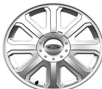
18" 8-Spoke Aluminum Wheel w/Bright-machined Finish Std. on LIMITED (641)