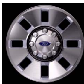
18" Forged Polished Aluminum (XLT) (Optional) (645)