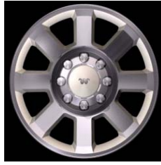
20" Premium Painted Forged Aluminum (Optional) (King Ranch) (643)