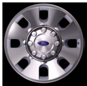
18" Premium Forged Polished Aluminum (Lariat) (Standard) (644)