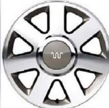
18" 7-Spoke Aluminum w/King Ranch Paint (King Ranch Pkg.) – 64R