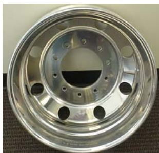
19.5" Forged Polished Aluminum (Std.) – (64D)