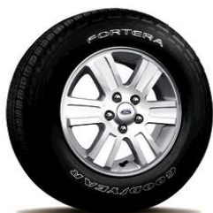
16" Painted Aluminum Wheel (Std. XLT) (64E)