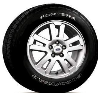
17" Painted Cast Aluminum Wheel – 64H (Avail. w/XLT Appearance Pkg. – 66T & Fleet Vehicles only)