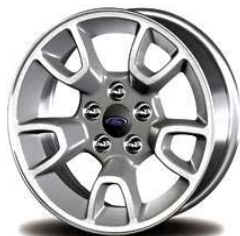
16" Y-Spoke Silver Painted-Inset Cast Aluminum (SPORT 4X4 S/C, FX4/Off-Road, option on XLT 4x4 S/C*) (647)