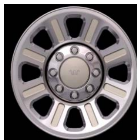
18" Painted Aluminum (Standard on King Ranch)