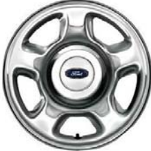
17" Chrome Clad Steel (Std. STX & XLT; Opt. XL SuperCrew) – 64E