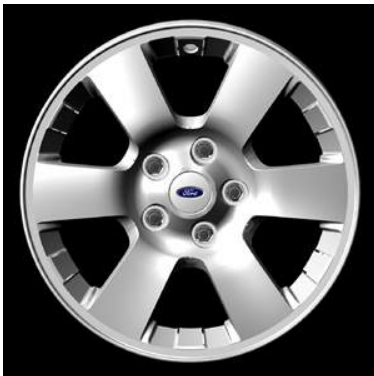
16" x 7" Bright Machined Aluminum Wheel (Std. LTD) – 64E