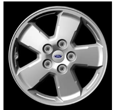
16" x 7" 5-spoke Cast Aluminum Wheel (Standard on XLT, Optional on XLS) – 64S