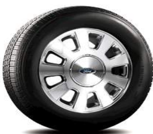
16" Chrome Plated Wheel Optional on LX