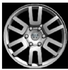
18" Machined Aluminum Wheel with King Ranch Center Caps (Std. on King Ranch Non-EL & EL) – T5P