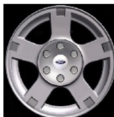
17" Machined Aluminum Wheel (Std. Eddie Bauer (Non-EL)) – 64J