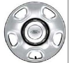
17" 7-Lug Steel Wheel (Heavy Duty Payload Pkg.) – 64K