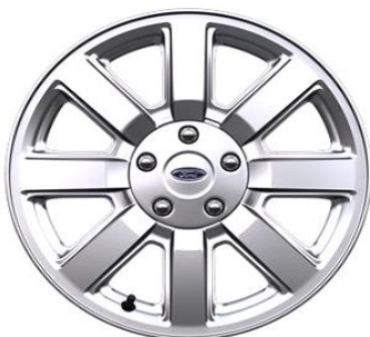
17" 8-Spoke Aluminium Bright-machined Wheel with Painted Pockets Std. on SEL (64W)