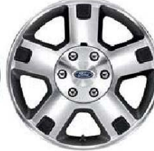
18" Machined Cast Aluminum Wheel (Std. FX4) – 64L