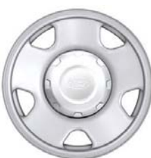
18" Argent Painted Steel (XL, SRW) (Optional) (64F)