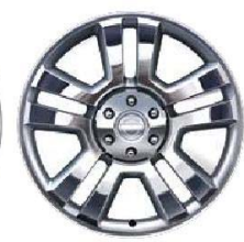
22" Polished Forged Aluminum Wheel with Painted Accents (Harley- Davidson™ Pkg.) – 64H