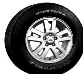
17" Painted Aluminum Wheel (Std. Eddie Bauer) (64H)