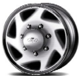
16" Full Sport Wheel Cover Standard on all Models (614)