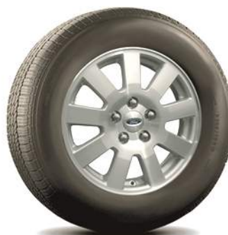
16" Nine Spoke Aluminum Wheel Std. on LX