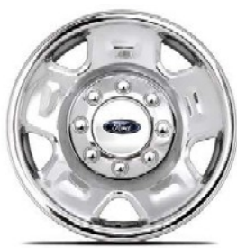
17" Chrome-clad Steel (XLT) (Standard) (64C)