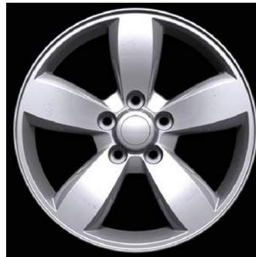
17" x 7" Chrome Clad Wheel (Optional on XLT and Limited) – 647 (Late availability)