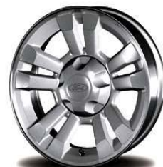
16" Twin-Spoke Silver Painted-Inset Cast Aluminum (option on SPORT 4x2 S/C) (646)