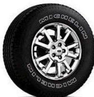
18" Machined Aluminum Wheel – 64T (Std. Limited)