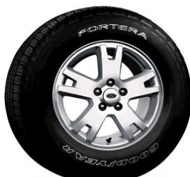
17" Machined Aluminum Wheel (64X)