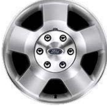
17" Machined Aluminum (Opt. STX, Inc. w/STX Special Edition Pkg.) – 64Y