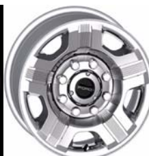
18" Premium Chrome-clad Steel (Standard on FX4) (64R)