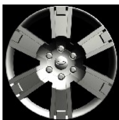
20" Chrome Clad Aluminum Wheel (Opt. Eddie Bauer & Limited (Non-EL & EL)) – 64M