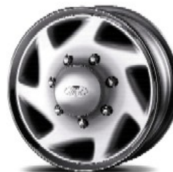
16" Full Sport Wheel Covers Standard on XL and XLT (614)