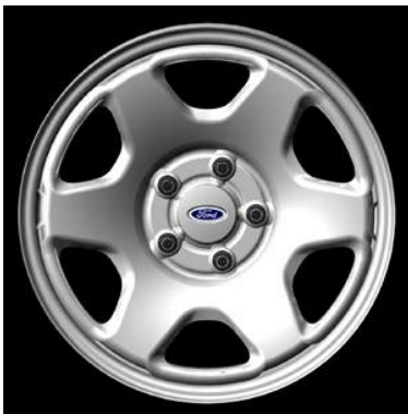
16" x 6.5" Steel Wheel (Std. on XLS) – 64C