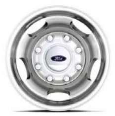
17" Forged Polished Aluminum (Standard FX4, Lariat, DRW) (Optional XLT, DRW) (64J)