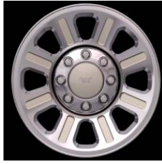
18" Painted Aluminum (Standard) (King Ranch)