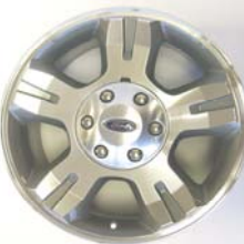
18" Aluminum Sport Wheel (Std, FX2 Sport Pkg.) – 64S