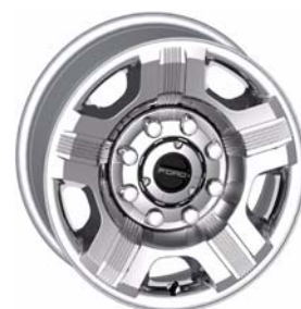
18" Premium Chrome-clad Steel (FX4) (Standard) (64R)