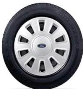
17" Styled Steel Wheel standard 750A & 770A, optional 720A & 730A