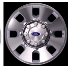
18" Premium Forged Polished Aluminum (Lariat, SRW) (Standard) (644)