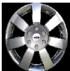
18" Chrome Clad Aluminum Wheel (Std. on Limited (Non-EL & EL), optional on XLT (Non-EL & EL) – 64L