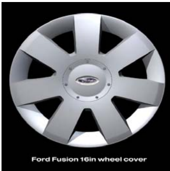
16" Steel Wheel w/Deluxe Wheel Cover Standard on S