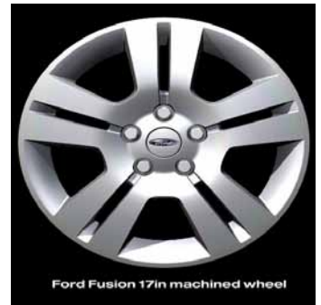
17" Aluminum Wheel Standard on SEL (FWD only)