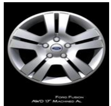
17" Aluminum Wheel Standard on V6 SEL (AWD only)