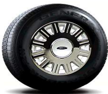
16" Steel Wheel Std. on Crown Victoria Standard