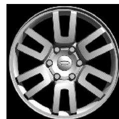
18" Machined Aluminum Wheel (Opt on XLT (Non-EL & EL) & Eddie Bauer (Non-EL only); Std on EL Eddie Bauer) – 64K