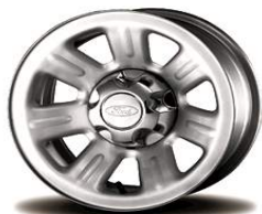
15" 7-Spoke Silver Painted Steel (XL 4X2/4X4, XLT 4x2) (64E)