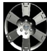
20" Chrome Clad Aluminum Wheel with King Ranch Center Caps (Opt. on King Ranch Non-EL & EL) – T21