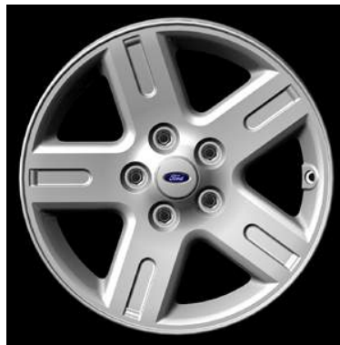
16" x 7" 5-spoke Cast Aluminum Wheel (Standard on Escape Hybrid)