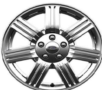
Chrome - Clad 18" 7-spoke Aluminum Wheel, Optional on SEL and Limited (647)