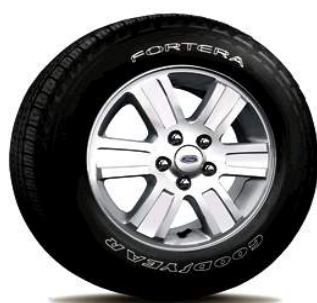
16" Painted Cast Aluminum Wheel – 64P (Std. XLT)