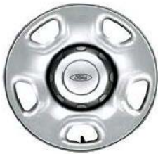
17" Grey Styled Steel (Std. XL) – 64C