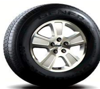
17" 5-Spoke Aluminum Wheel Optional on LX ordered with option 41K