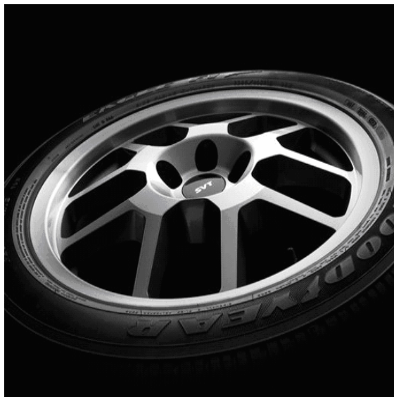
18"x9.5" Bright Machined Aluminum Wheels Standard on GT500 Coupe & Convertible