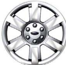
20" 6-Spoke Machined Aluminum Wheel (Opt. FX4, Lariat & King Ranch Pkg.) – 64N