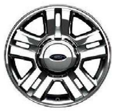
18" Chrome Clad Aluminum (Std. XLT & Lariat Chrome Pkgs.) – 64T