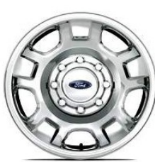
18" Chrome-clad Steel (XLT, SRW) (Standard) (64E)