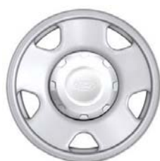
17" Argent Painted Steel (XL, SRW) (Standard) (64A)