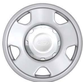
17" Argent Painted Steel (XL) (Standard) (64A)