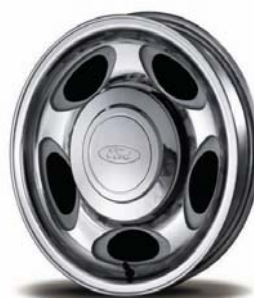
16" x 7" Forged Aluminum Opt. on Commercial & Recreational (64F)